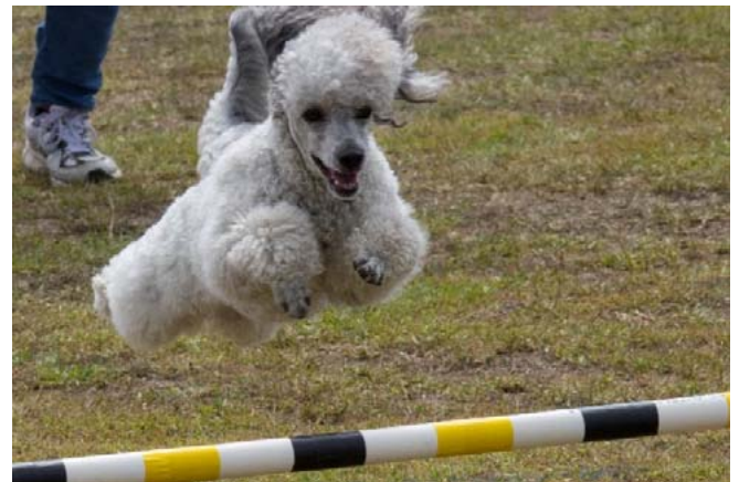
Norm Morcom's mini poodle Pearl picked up a couple of first places in jumping and pairs.