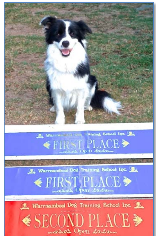
Below: The scenery at Warrnambool Dog Training School on competition day

Georgia's formal kennel name is now Khayoz Heavens Star RN CDX