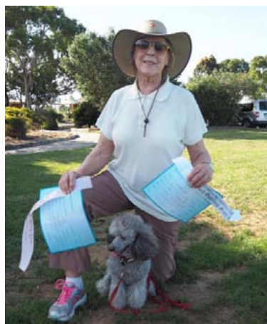
Nola guided speedy 'Pearl'