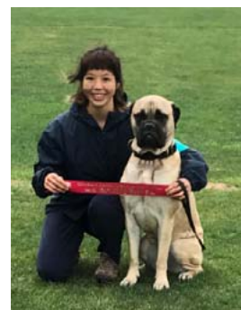
Yoshi and 'Ai' scored their 1 st pass in Rally Novice