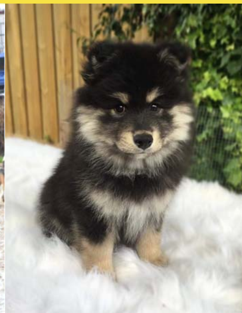
This little cutie has signed up for classes...