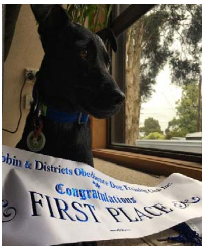
Pippin posing for success