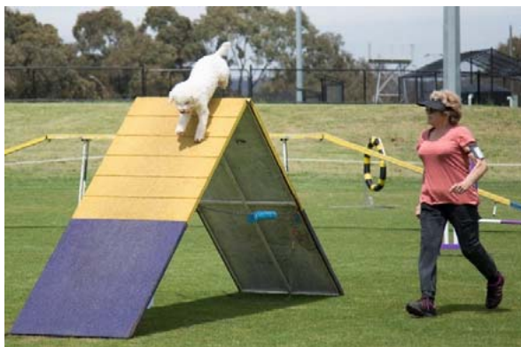
Margaret Keil with 'Lucille'

Our helpers were too numerous to name them all, but I'd like to particularly acknowledge prodigal son Kane Wheeler who took on, and excelled at, the critical task of entering results into the database and printing the pass cards. Our system had to track results in 102 separate event categories on the day.