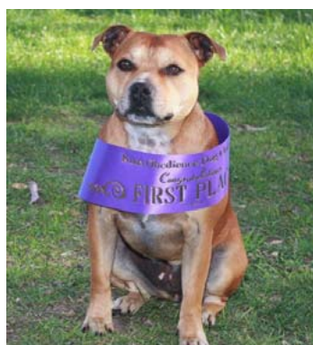
'Ruby' 1 st place Rally Novice