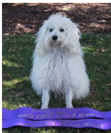
'Shazam' 1 st place UD & UDX