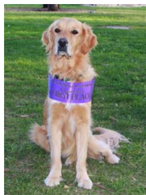
'River' 1 st place Rally Excellent